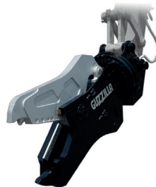
Cutting Crusher MFP Series