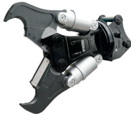
Cutting Crusher D-SRC Series