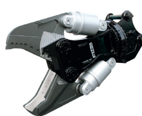
Steel Frame Cutter DSX Series