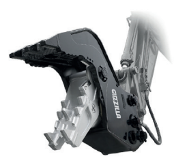
Pulverizer MC Series