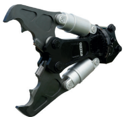
Concrete Crusher D Series