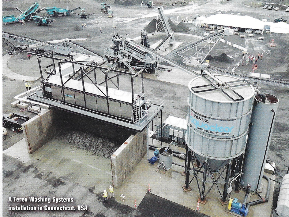
A Terex Washing Systems installation in Connecticut, USA

TWS also said its readily portable format makes it particularly suitable for greenfield applications, contractor use and temporary planning permission sites, and said that