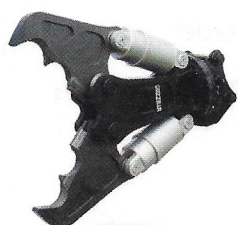
Concrete Crusher D Series