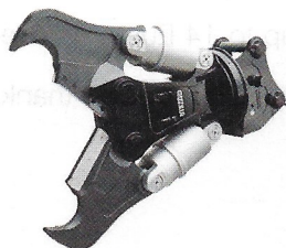
Cutting Crusher D-SRC Series