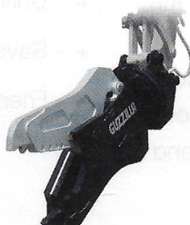
Cutting Crusher MFP Series