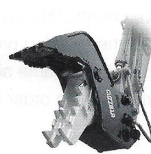
Pulverizer MC Series