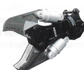
Cutter DSX Series